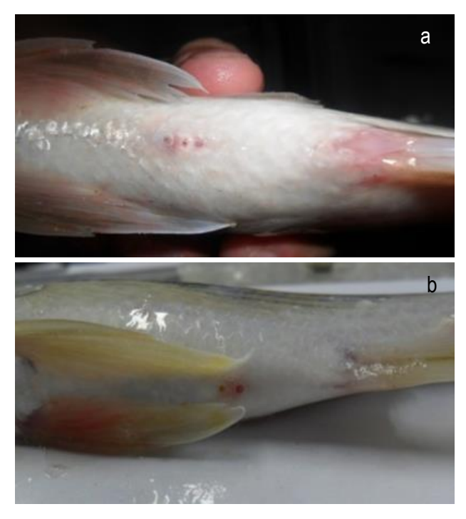
Figure 3. a) The ventral region of carapebas with vision of the papilla urogeni of females, and b) males