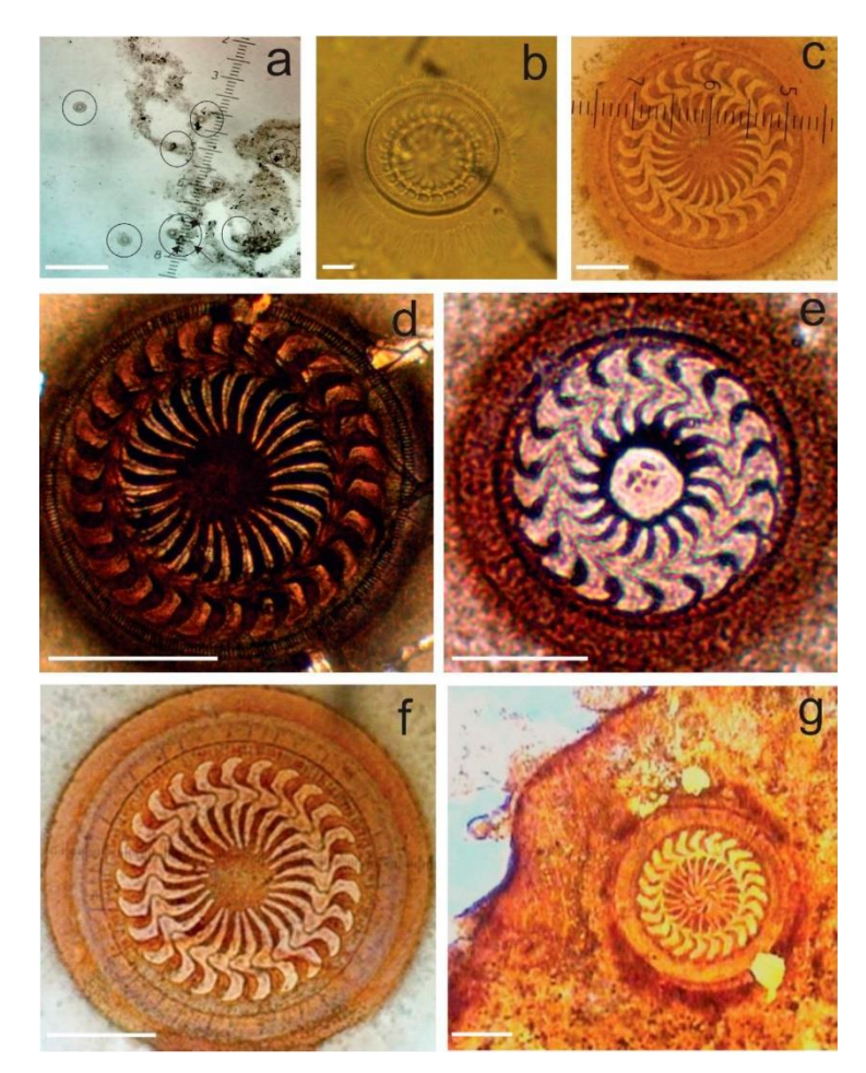
Figure 3. a) Trichodinids in a fresh-mounted smear from the gill arches, b) differential interference contrast microscope, c) an adhesive disc of Trichodina in silver nitrate impregnation, d) T. pediculus , e) T. compacta , f) T. nigra , and g) T. centrostrigeata . Scale bars: a,e,g = 50 \,\mu m; b,c,d,f = 20 \,\mu m.

abundance of trichodinids in the control group did not differ significantly with the abundance recorded in the individuals of the three NaCl doses. In this study, new reports of trichodinid specimens identified in tilapia cultivated in Tabasco, Mexico are described (Fig. 3).