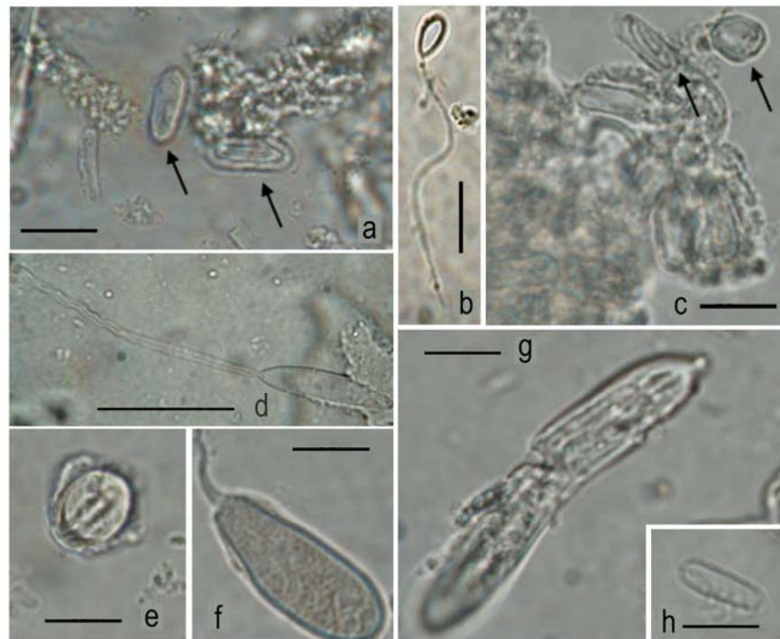
Figure 2. Tentacular nematocysts of Chiropsalmus quadrumanus before and after hydration. a) Two ellipsoid isorhizas (indicated by arrows) in ethanol preserved and non-hydrated tissue, b) discharged isorhiza, after 5 days of hydration, c) undischarged isorhiza (left) and eurytele (right) (indicated by arrows), after 5 days of hydration, d) discharged mastigophore, after 7 days of hydration, e) undischarged eurytele, after 7 days of hydration, f) discharged eurytele, after 7 days of hydration, g) broken capsule of a mastigophore, after 9-10 days of hydration, h) empty capsule of isorhiza, after 9-10 days of hydration. Scale bars: a, b, c, e, f, g, h = 10 micrometers, d = 50 micrometers.

Chiropsalmus quadrumanus , but broken capsules or groups of mastigophores between gelatinous tissue were difficult to examine (Fig. 2d). This deteriorated material after 10 days made us interrupt the experiment.