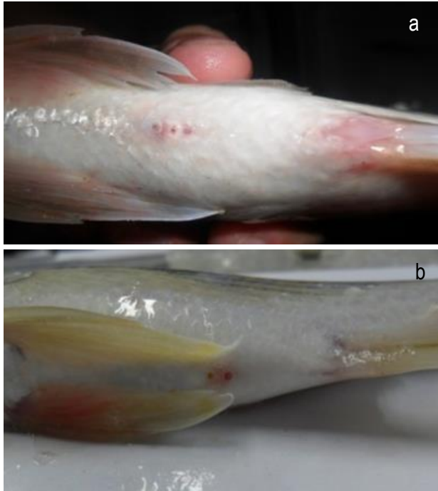
Figure 3. a) The ventral region of carapebas with vision of the papilla urogeni of females, and b) males

The physical and chemical parameters in a confined environment were as follows: 7.7 \pm 0.3 mg L -1 oxygen-O 2 , 26.9 \pm 1.4 temperature (T°C), 7.7 \pm 0.1 pH, 13.7 \pm 2.5 salinity, 18.9 \pm 0.1 μS cm -1 conductivity, 12.3 \pm 0.1 mg L -1 total dissolved solids (TDS), and 70.0 \pm 7.0 mg L -1 oxide-reduction potential (ORP) were measured during the experiment and presented satisfactory results. The ammonia (<1 mg L -1 ) showed low values, showing no significant changes throughout this study.