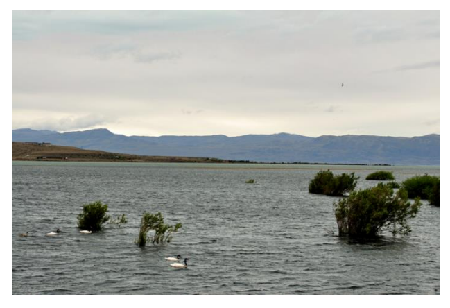
Figure 1. Laguna de los Cisnes, a natural monument where the black-neck swam and other bird species inhabit. The lagoon should be considered a natural laboratory to monitoring climate change in a context of climate change, as salinity fluctuations associated to rainfall determine the zooplankton and phytoplankton diversity. During summer in the southern hemisphere (December), the lagoon is heavily impacted by environmental conditions.

persimilis (Piccinelli & Prosdocimi, 1968), a species restricted to the Chilean and Argentinian Patagonia (Gajardo & Beardmore, 1993; Gajardo et al. , 2002; Van Stappen, 2002) which is predated by flamingos and other water birds found in the lagoon associated to it. Owing to the ecosystemic relevance of Laguna de los Cisnes, this note reports water, sediment and planktonic composition obtained during a December (summer) Artemia sampling campaign.