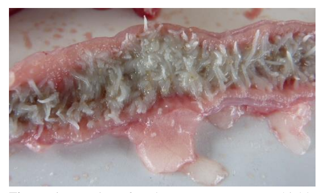
Figure 1. Intestine of Colossoma macropomum highly infected with Acanthocephalans.

IF had the following clinical signs: cachexia, growth retardation, decrease of mucus production, dryness on the body surface and the skin became dull. Macroscopically, head and body size were disproportional and it