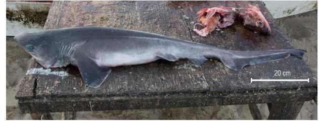
Figure 2. Juvenile female of Hexanchus griseus caught off the fishing camp of Punta Lobos, BCS, Mexico.

The caught specimen was dark grey without spots on the back and white on the belly, with no clear boundary between the two colours (Fig. 2). Its flabby body, typical of organisms inhabiting the mesopelagic or bathypelagic zone (Randall & Farrell, 1997), had an epidermis entirely covered with mucus, with no ectoparasites detected.