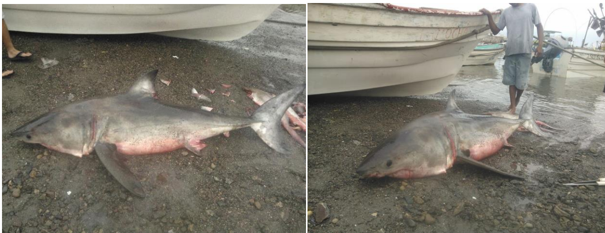
Figure 2. A female juvenile of white shark caught off the coast of Mazatlán (22°51.050'N, 106°17.522'W) on the December 20th, 2013 by artisanal fishermen.

Presence of juvenile individuals in GOC has been reported mostly in the upper Gulf, mainly in shallow waters during the cold season (December to May) (Galván-Magaña et al. , 2010; Oñate-González et al. , 2015), this is contrary to found in this study at southeastern GOC in cold season, in these productivity nearshore waters where most artisanal and industrial fishery operate, making them vulnerable to fishing mortality. Another report of presence was a white shark tagged with a pop-off satellite tag and released off the coast of California by the Monterey Bay Aquarium (J. O'Sullivan, pers. comm. ) showed the movement of the shark southward. The satellite tag was recovered off the coast of Cabo San Lucas (southern tip of Baja California), revealing a trajectory of the juvenile white shark towards the GOC and this behavior is probably to feeding at this zone (Jaime-Rivera et al. , 2014). The Gulf is an area of high productivity, but also a zone with susceptibility for capture given the high fishing activity.