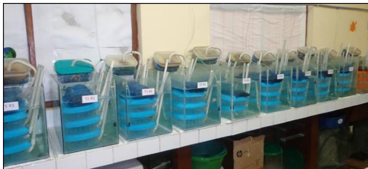
Figure 1. C. caementarius culture system in individual containers installed in aquaria with water recirculation and percolator biological filter.