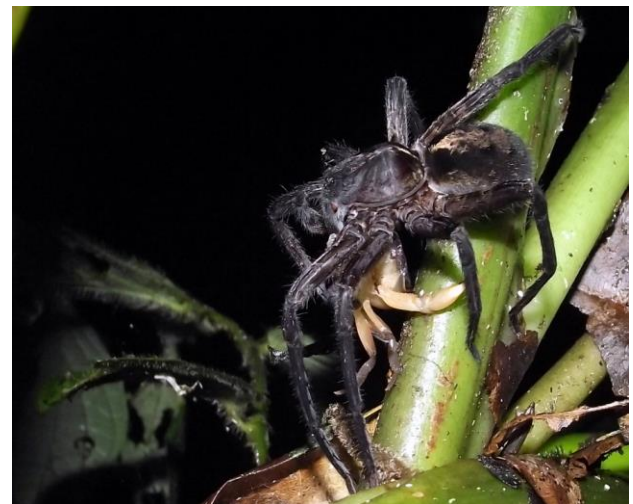
Figure 5. A spider (family Ctenidae) (black color) observed at night with a freshwater crab ( Ptychophallus uncinatus ) (light colored) held in its chelicerae in Veragua Rainforest Research & Adventure Park in Limón Province, Costa Rica.

The observation that P. uncinatus is a predator of frogs (Fig. 4) is in agreement with reports by Willink et al. (2014) that demonstrated that other species of pseudoscorpionids in Costa Rica were one of three classes of predators of poison-dart frogs. In that study,