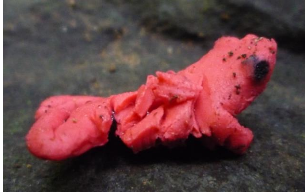
Figure 6. A red clay model of a frog set in the Veragua Rainforest Research & Adventure Park, Limón Province, in the Atlantic drainage of Costa Rica showing the marks after having been attacked by a freshwater crab.

of their bodies (Affonso & Signorelli, 2011). Freshwater crabs from different continents have been observed to feed on juvenile and adult anurans, and there are several records of freshwater crabs feeding on the eggs and tadpoles of amphibians (Toledo, 2005; Gutsche & Elefant, 2007; Caldart et al. , 2011; Andrade et al. , 2012; Pyke et al. , 2013; Rosa et al. , 2014; Nogueira-Costa et al. , 2016). Despite the scarcity of information available, it is clear that freshwater crabs do indeed attack and feed on anurans and their egg clutches. However, further field and experimental studies are needed to foster our understanding of the interactions between pseudoscorpionid crabs and anurans.