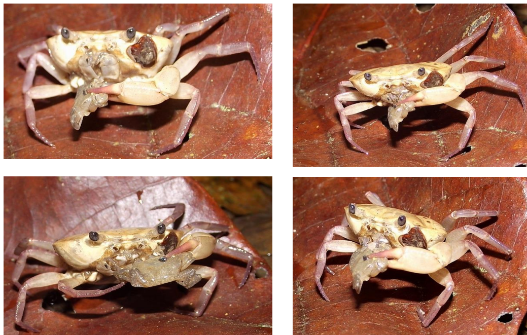
Figure 2. Ptychophallus uncinatus observed at night predating a smaller juvenile crab (possibly of the same species) near a stream in Quebrada Campamento in Veragua Rainforest Research & Adventure Park in Costa Rica.

feeding on an insect larva (Diptera; probably of the family Muscidae), which is held in its chelipeds (Fig. 3a, Table 1).