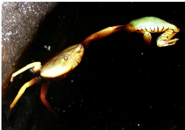
Figure 4. Ptychophallus uncinatus holding the head of a frog ( Cruziohyhla calcarifer ) in its cheliped in Veragua Rainforest Research & Adventure Park in Limón Province, Costa Rica.

1981). Although Yeo et al. (2008) stated (as an unpublished observation) that cannibalism is not uncommon among freshwater crabs, descriptions on this behavior in freshwater crabs are scarce (Ng & Ng, 1987; Maitland, 2003). Our observations (Fig. 1) demonstrated that intraspecific predation occurs in P. uncinatus . Additional studies, however, are required to assess the importance of this behavior in the feeding habits of this freshwater crab.