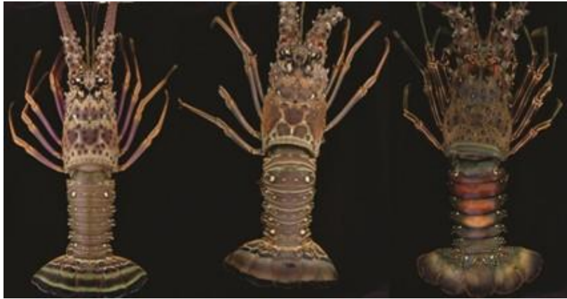
Figure 1. Individual lobsters collected in Bahía de la Ascensión, Mexico. From left to right: Panulirus meripurpuratus , P. argus , and P. laevicauda .